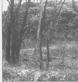
Pictured is Pulpit Rock as it appears today